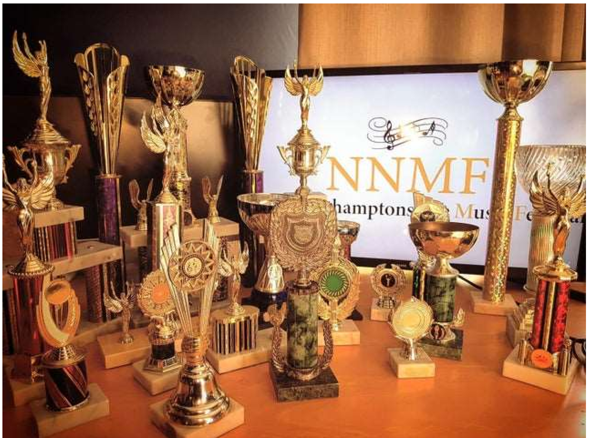
The trophies on offer

The syllabus and entry details have already been published in anticipation of the chorus of approval from performers starved of the chance to compete.