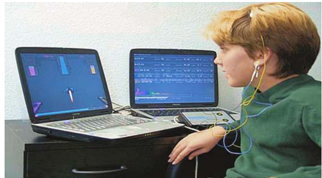
Fig. 1 Sample of neurofeedback set-up

As a child learns to control and improve brainwave patterns, the game scores increase and progress occurs. The only way to succeed at the games is for children to improve their brainwave function (following an operant conditioning paradigm). In research and clinical treatment