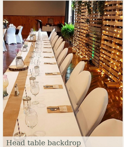
Head table backdrop