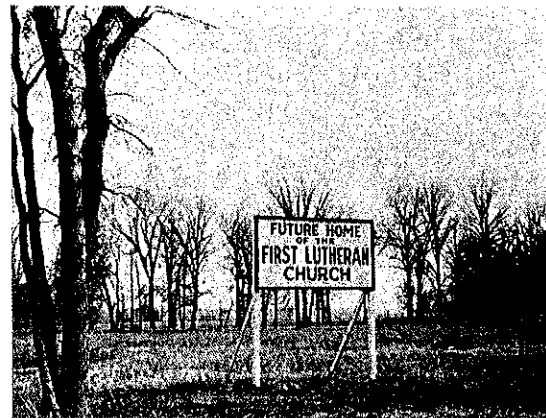
First Lutheran Church and Parsonage. 11.3 Acre lot purchased to build Redeemer in 1961