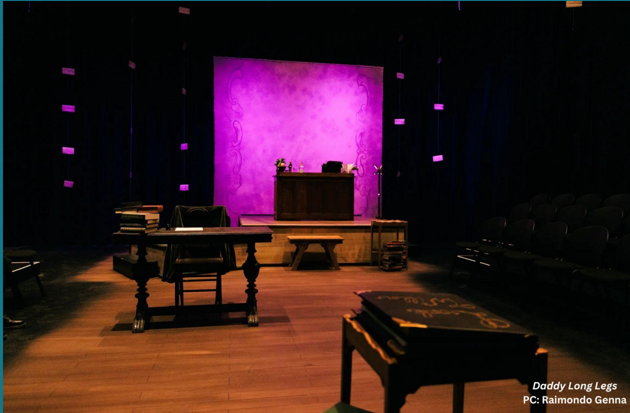
Daddy Long Legs