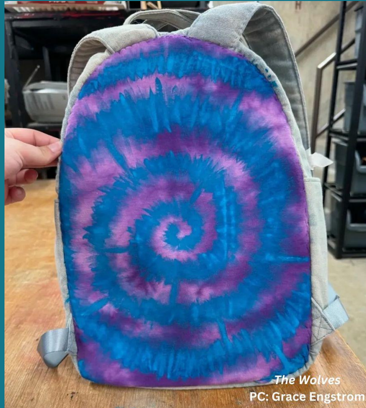
The Wolves