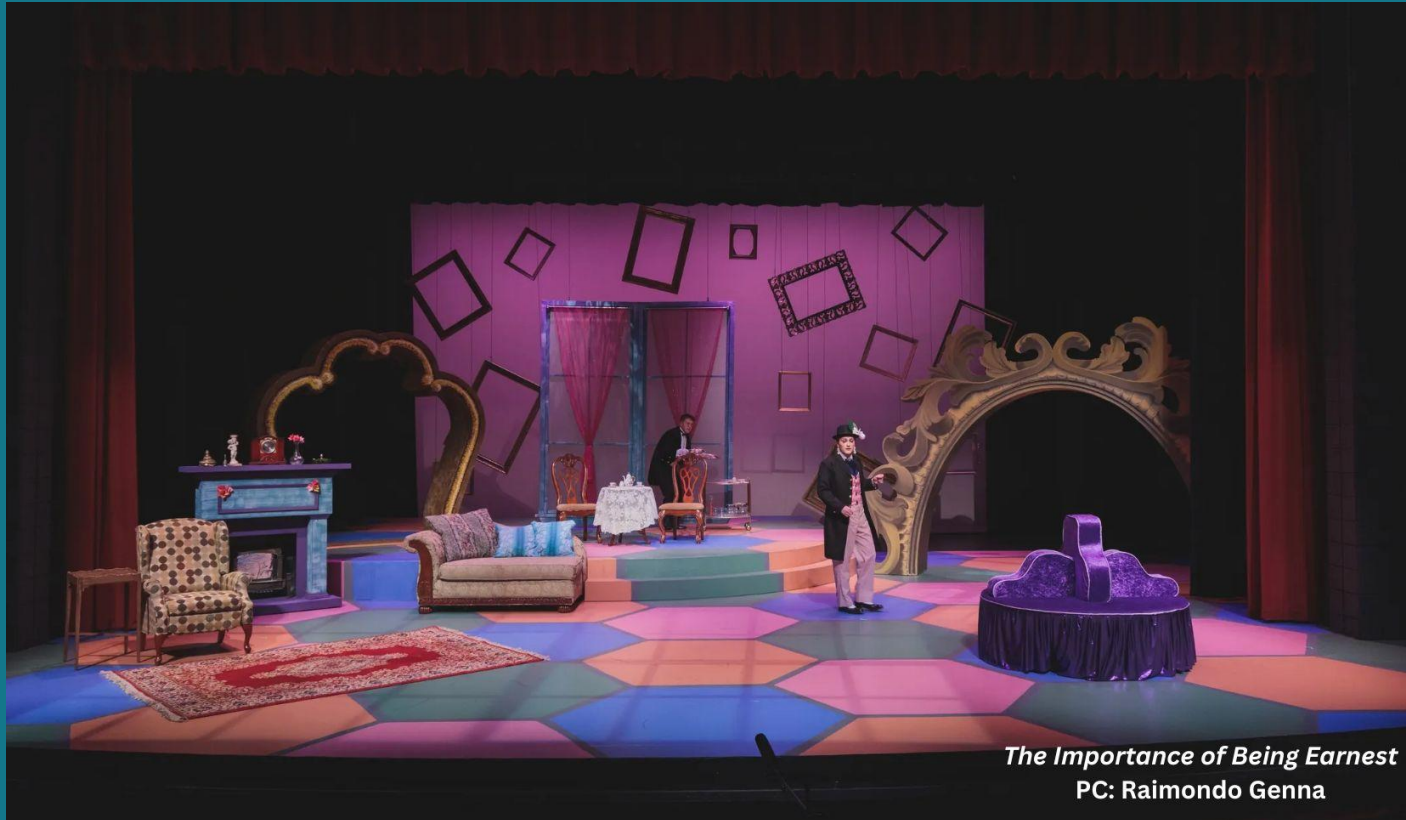
The Importance of Being Earnest