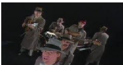
1980's Superstars Hall & Oates