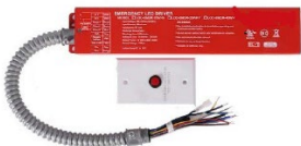
Built-in Emergency Back-up Driver