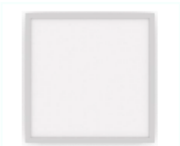
2x2 – 15W / 19W / 24W / 29W