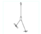
Aircraft Cable Kit 120-MT-FP-ACK