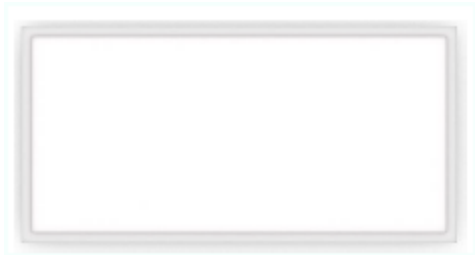
2x4 – 29W / 34W / 39W / 49W