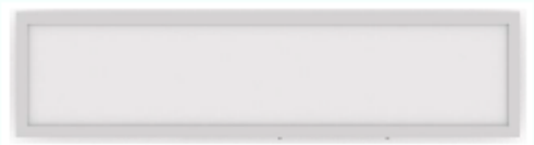
1x4 – 15W / 19W / 24W / 29W