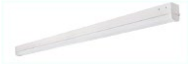
4 Foot – 20W / 30W / 40W