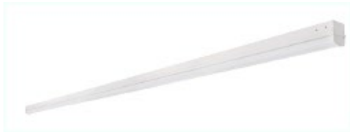
8 Foot – 40W / 60W / 80W