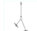
Aircraft Cable Kit 1201-MT-ST4/8-ACK