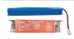
Emergency Back-up Driver 120-4/8-EMB-ST Factory installed (allow longer lead time)