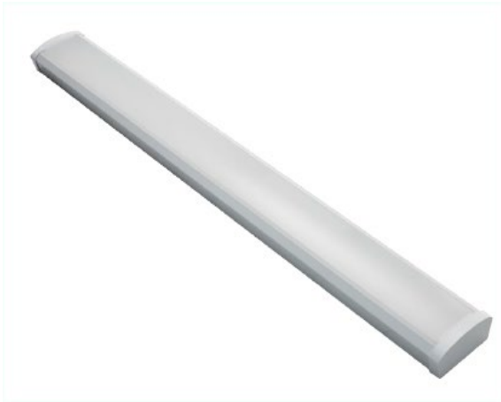
32W / 40W / 48W 3500K / 4000K / 5000K