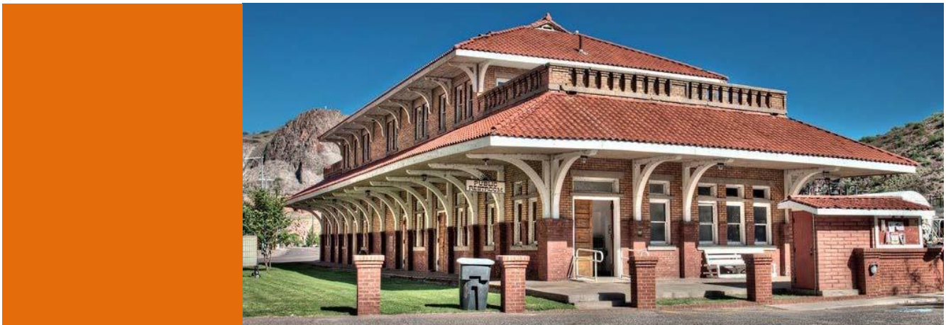
Town of Clifton Visitor Center

Collaborative efforts from the Clifton Visitors Center and the Clifton Library support mural, as well as other art and storytelling programs at these facilities. Such programs are vital to economic development.