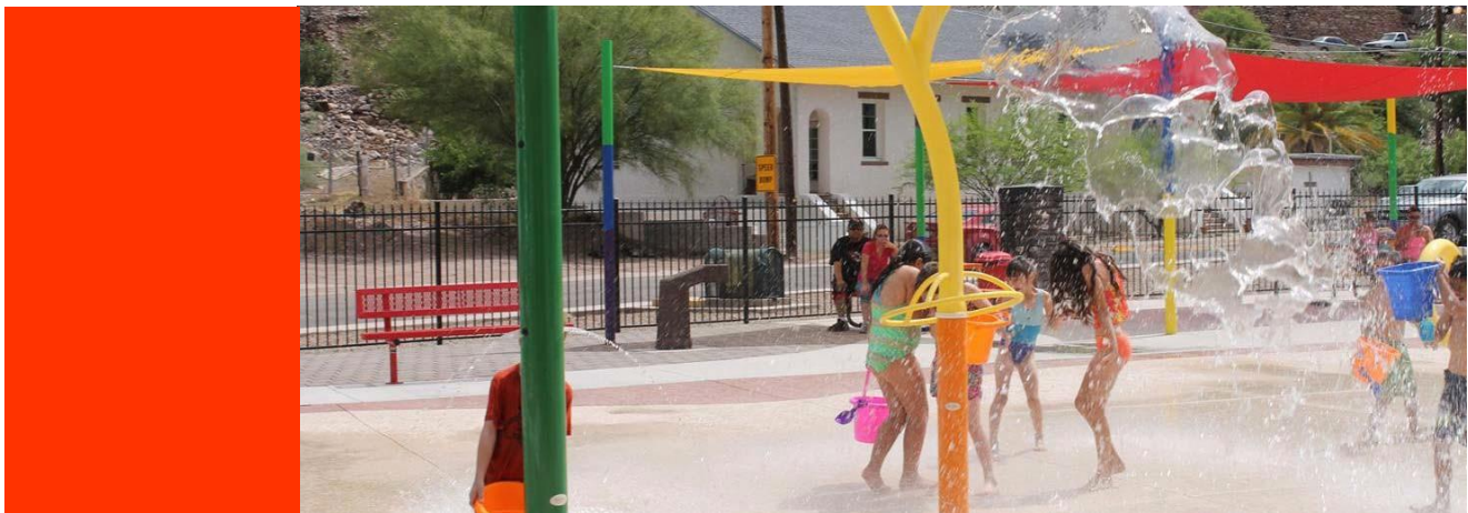
Town of Clifton Splash Pad Park the Town's favorite spot for its young population.