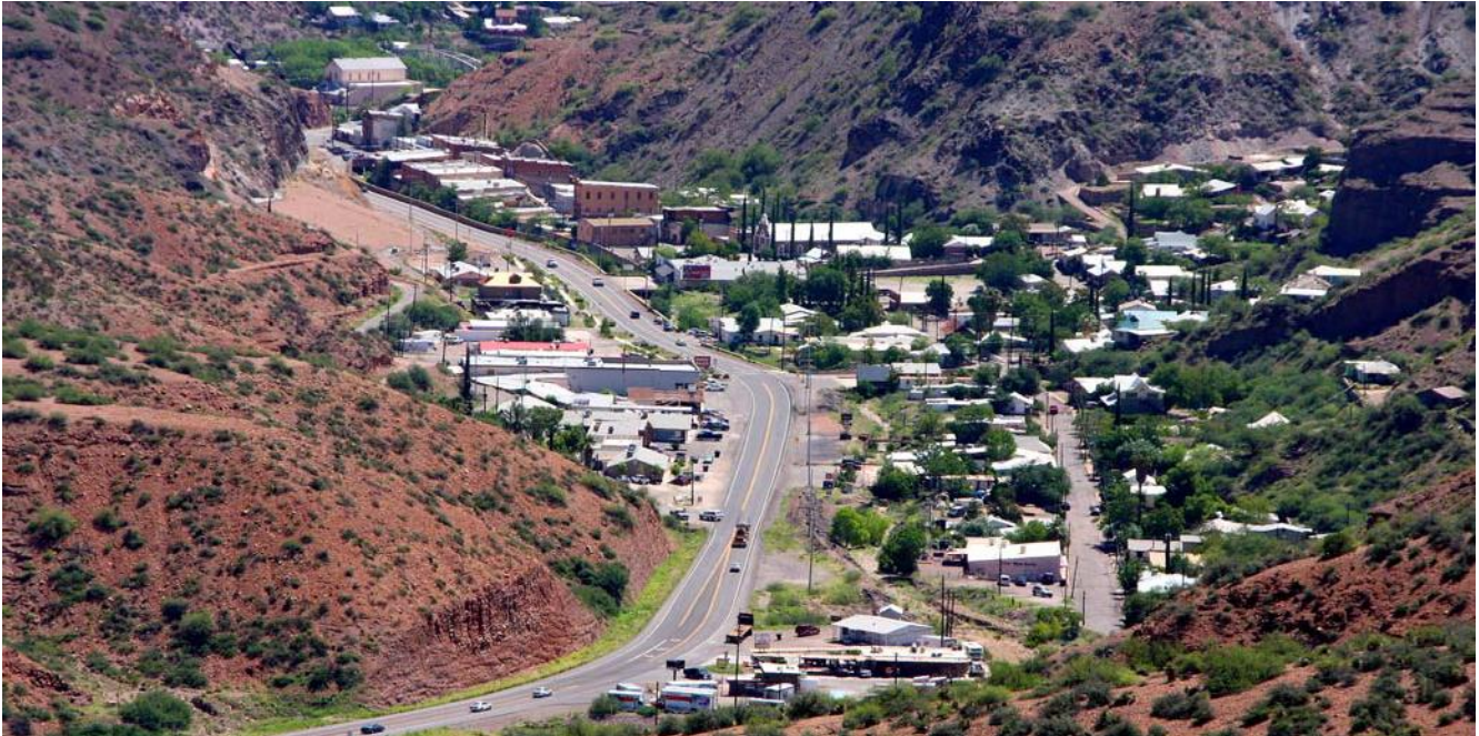
Town of Clifton Coronado Boulevard/U.S. Highway 191 (Historic Route 666)

In addition, the 2010 Census reports a total of 143 households under the Female Householder, No Husband Present Families category. Of that total, 106 households, or 74.1 percent, include related children under 18 years, and 86 households, or 60.1 percent include own children under 18 years.