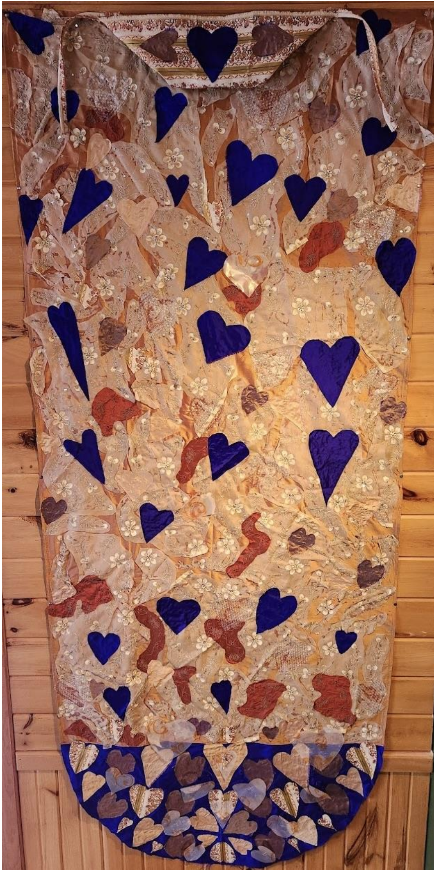
CLOAK OF SHREDDED HEARTS . Oonagh E. Fitzgerald, 2023. 10' x 3.5', worn fabric scraps, plastic.