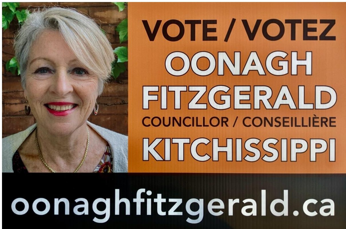
Figure 25. SDG IMPLEMENTATION AT THE LOCAL LEVEL: theory and practice (municipal election campaign, lawn sign and Person's day event)