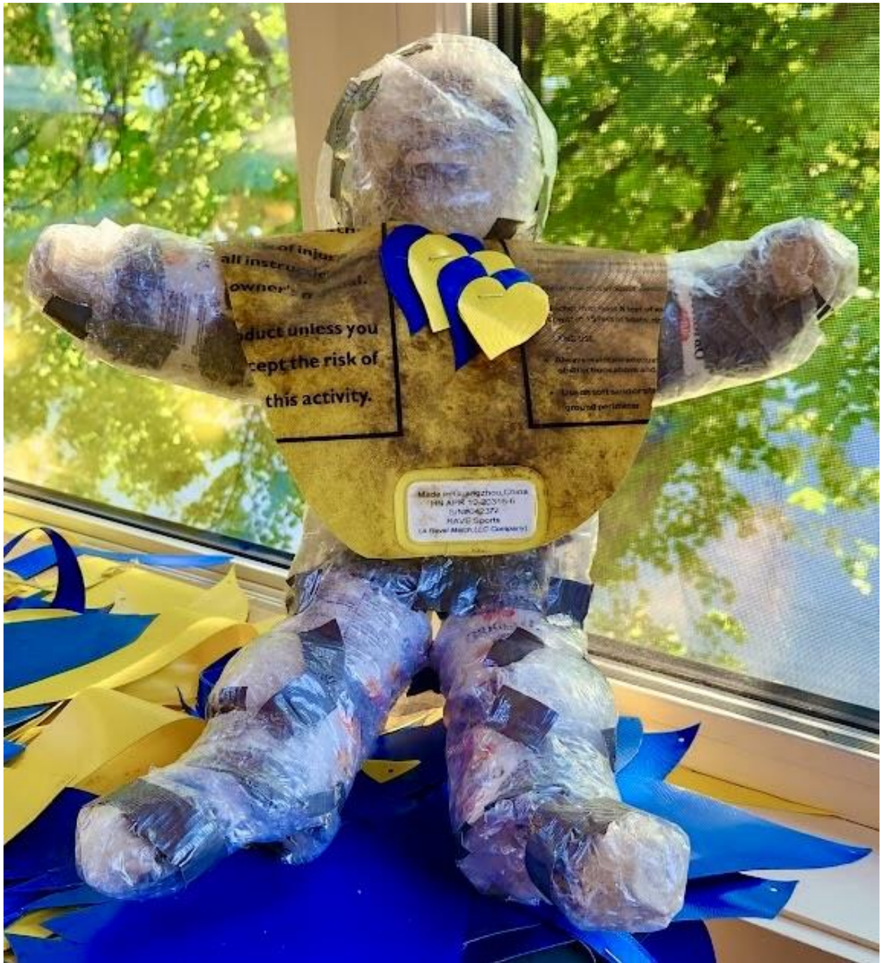
INFANT - LOVE IS POISON. Oonagh E. Fitzgerald, 2024. 3" X 2", waste plastic.