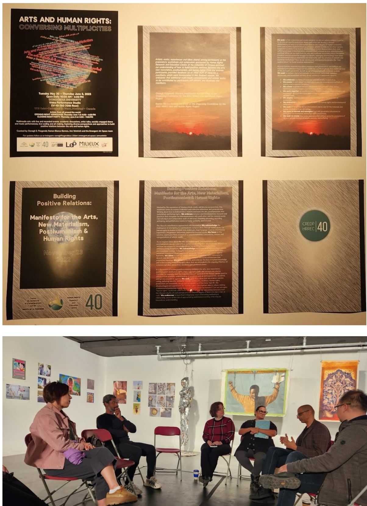
Figure 17. BUILDING POSITIVE RELATIONS: THE ARTS, NEW MATERIALISM, POSTHUMANISM AND HUMAN RIGHTS . Photographs from the art exposition co-curated by Oonagh E. Fitzgerald, Ramon Blanco-Barrera and Ann Wettrich.