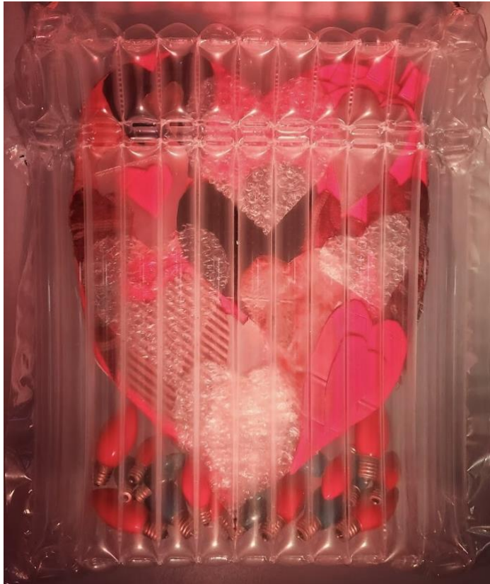
ADVERTISEMENT FOR MICRO-OPERA . Oonagh E. Fitzgerald, 2023. Digital and card paper print.