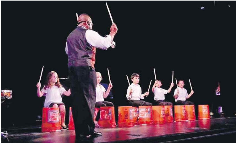
NAPOLEON REVELS-BEY'S COLLECTIO