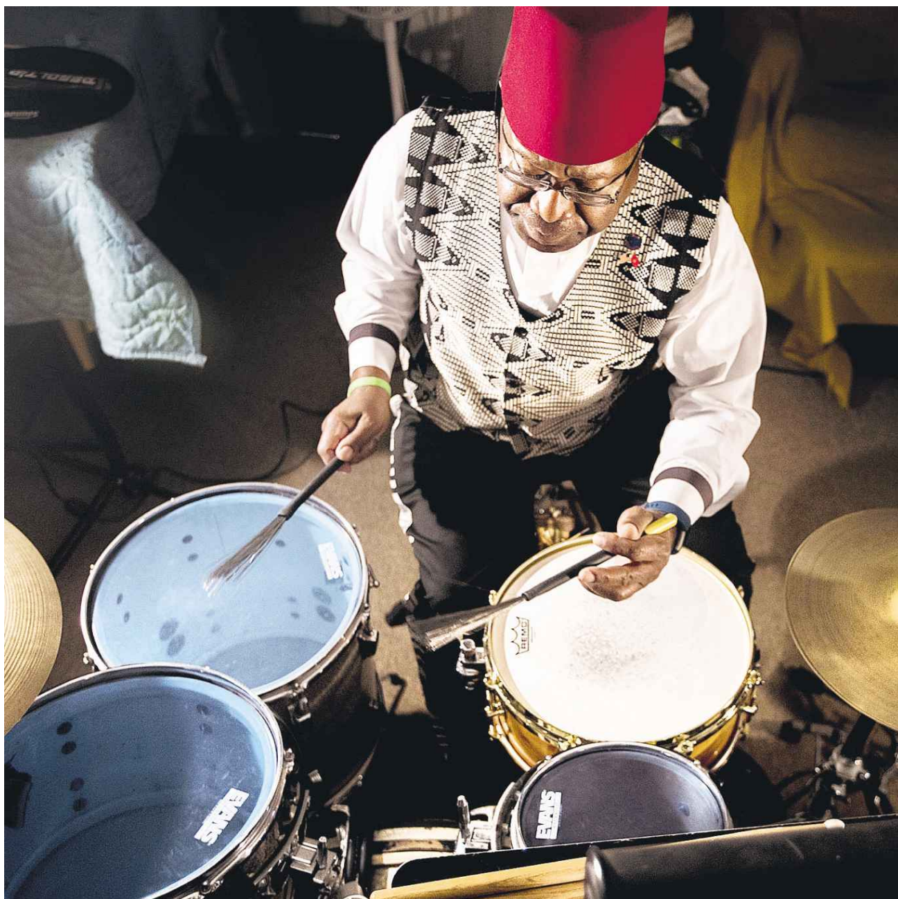
A longtime drummer, Revels-Bey teaches musical education to students in Long Island and New York City public schools.