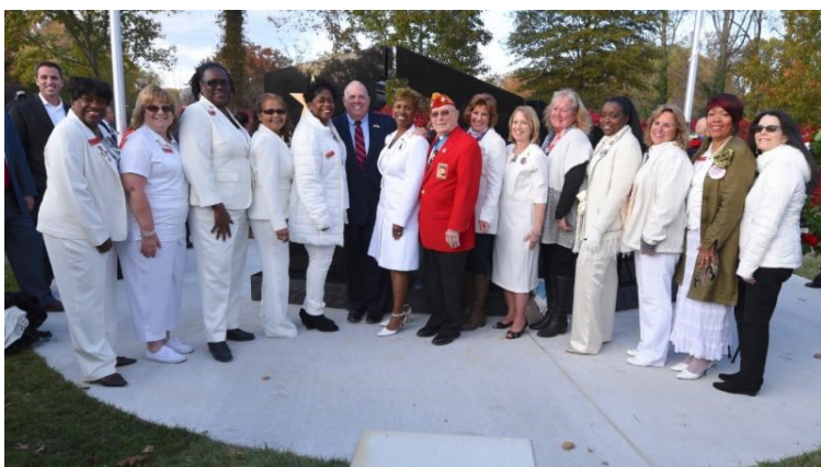
Governor Larry Hogan and Mr. Hershel "Woody" Williams in front of the Memorial