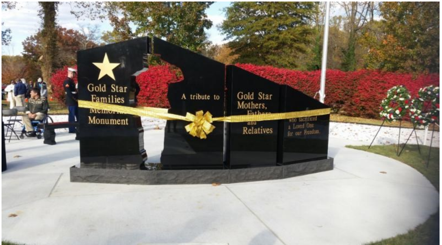
Gold Star Families Memorial Monument