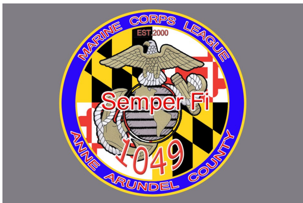
Anne Arundel County Detachment 1049 New Logo