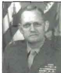
LOUIS H. WILSON, Jr. Captain United States Marine Corps Medal of Honor — 1944 2/9/3 Guam