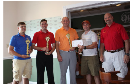
3rd Place winner