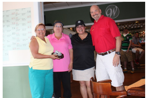
Last Place Winner