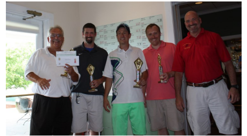
2nd Place Winner