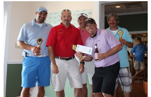
1st Place Winner