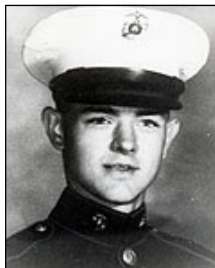
Larry E. Smedley Corporal United States Marine Corps Medal of Honor -- 1967 1/7/1 Vietnam CITATION: