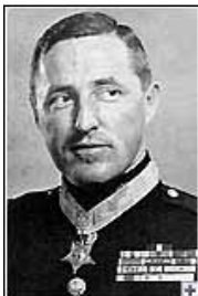
Raymond G. Davis Lieutenant Colonel United States Marine Corps Medal of Honor — 1950 1/7/1 Korea CITATION: