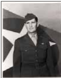
Joseph J. Foss Captain United States Marine Corps Medal of Honor -- 1942 VMF-121 Guadalcanal CITATION:

For outstanding heroism and courage above and beyond the call of duty as Executive Officer of a Marine Fighting Squadron, at Guadalcanal, Solomon Islands. Engaging in almost daily combat with the enemy from October 9 to November 19, 1942, Captain Foss personally shot down twenty-three Japanese planes and damaged others so severely that their destruction was extremely probable. In addition, during this period, he successfully led a large number of escort missions, skillfully covering reconnaissance, bombing and photographic planes as well as surface craft. On January 15, 1943, he added three more enemy planes to his already brilliant successes for a record of aerial combat achievement unsurpassed in this war. Boldly searching out an approaching enemy force on January 25, Captain Foss led his eight F4F Marine planes and four Army P-38s into action and, undaunted by tremendously superior numbers, intercepted and struck with such force that four Japanese fighters were shot down and the bombers were turned back without releasing a single bomb. His remarkable flying skill, inspiring leadership and indomitable fighting spirit were distinctive factors in the defense of strategic American positions on Guadalcanal.