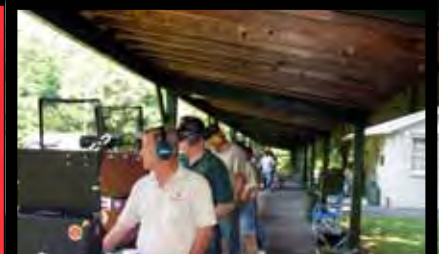
Team on the firing line at Lewistown Pistol Club's Police "L" Match. At left are the team's awards.