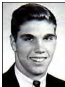
William D. Morgan Corporal United States Marine Corps Medal of Honor -- 1969 2/9/3 Vietnam CITATION: