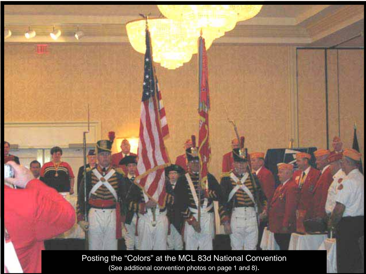
Posting the "Colors" at the MCL 83d National Convention (See additional convention photos on page 1 and 8).