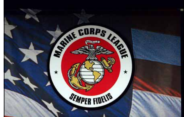
Thursday, December 20, 2007