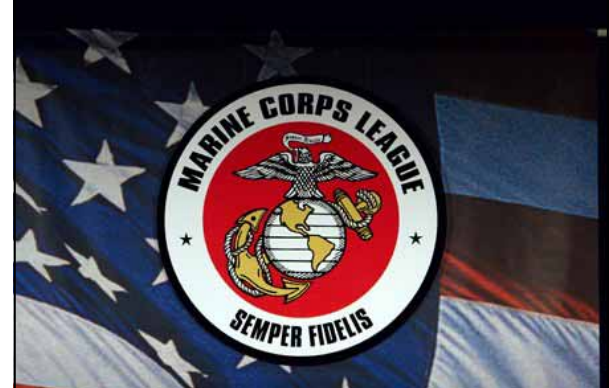
Saturday, November 17, 2007