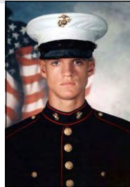
JASON DUNHAM CORPORAL United States Marine Corps Medal of Honor — 2007 3/7/1 Iraq CITATION