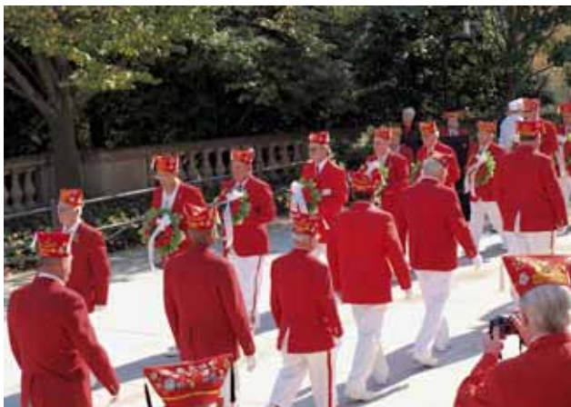
One 'squad' of Cooties returns after presenting their wreaths while the next marches to present the next group of wreaths.