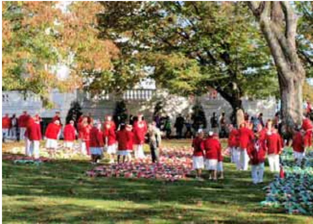
Members of the Cooties staging commemorative wreaths prior to the start of wreath-laying ceremony.