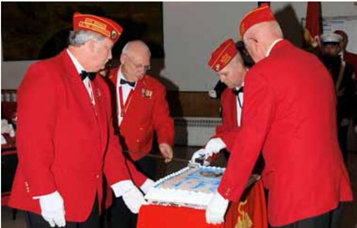
Icing the cake with a Staff NCO sword can be a challenge!