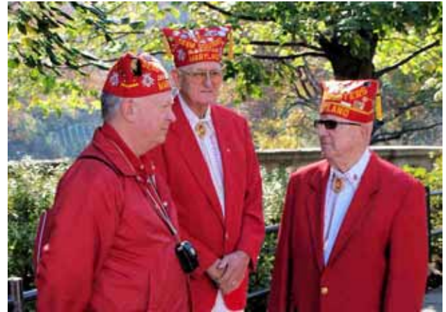
Cooties, who are also members of our MCL Detachment, wait for the ceremonies to begin.