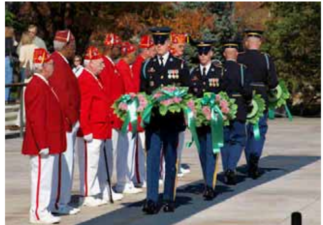
Wreaths presented to ceremonial guard detachment for placement adjacent to the Tomb of the Unknowns.