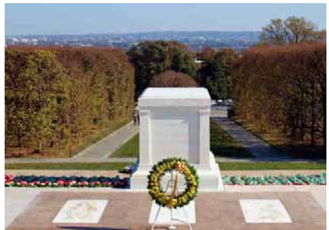
The Tomb of the Unknowns surrounded by wreaths, which were presented by the Cooties as part of their 75th Annual Tomb Trek.