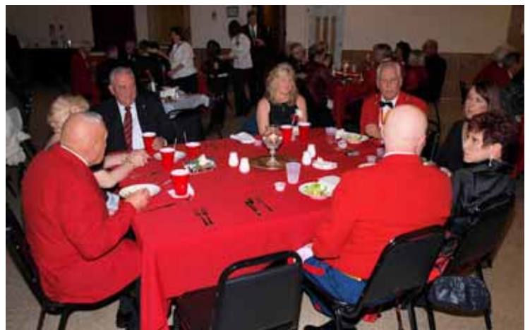
Occasionally, someone needs to have the punch line explained.