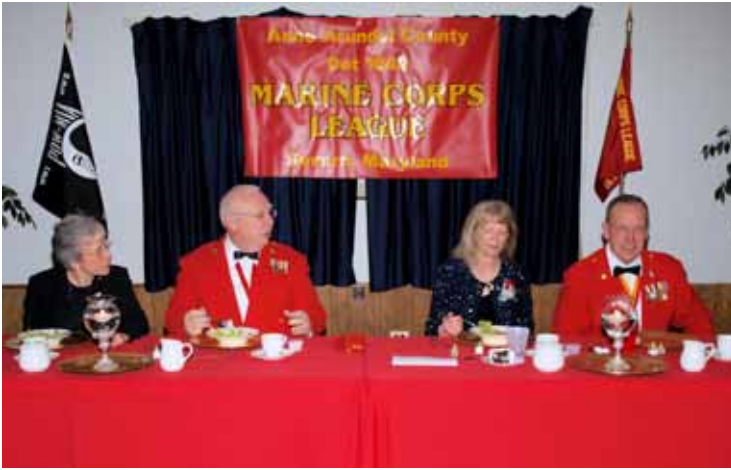
Hope that was a 'whoopee' cushion!