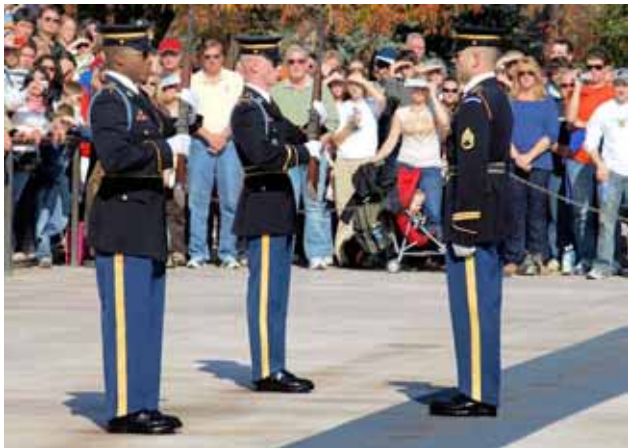
Guards at the Tomb of the Unknowns being inspected by the Sergeant-of-the-Guard.