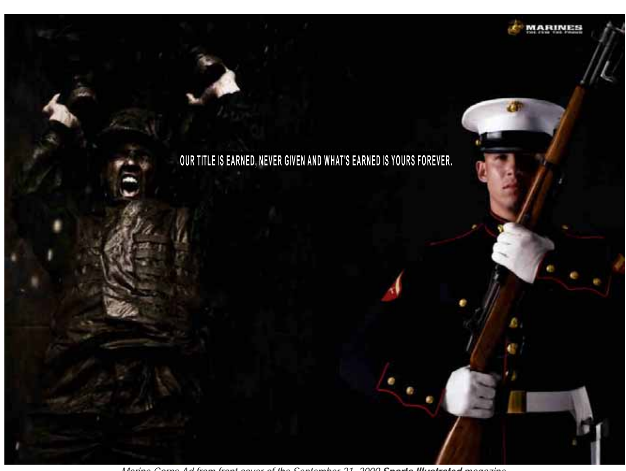
Marine Corps Ad from front cover of the September 21, 2009 Sports Illustrated magazine.