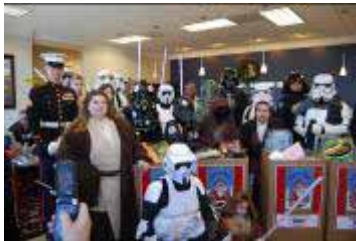
Caldwell Banker Star wars event by Arundel Mills