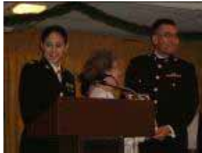
Two Marine Captains presenting award