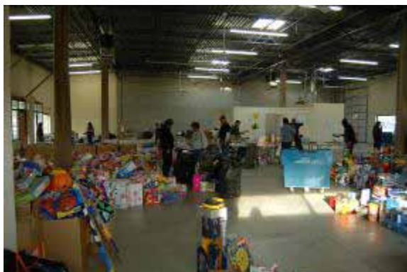
People from the community helping to sort toys