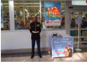
Marine at Toys R Us in Glen