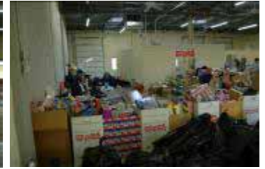
Toys picked up at different locations.