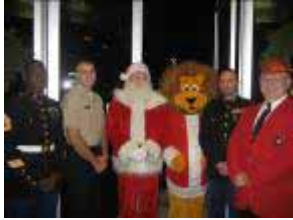
Annapolis Bank Lion Lighting event at Bestgate