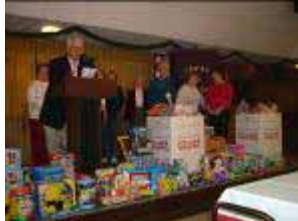
Severna Park Elks Toys for Tots