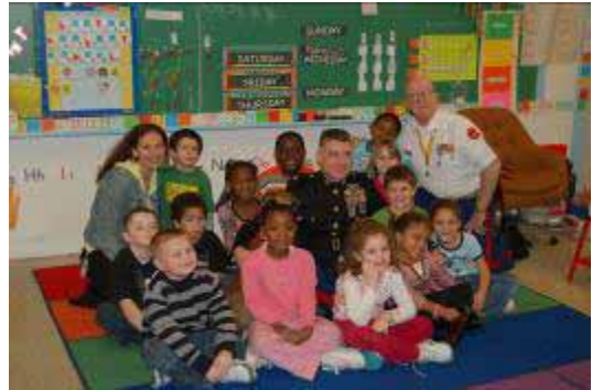
Kindergarden class at Belle Grove Elementary