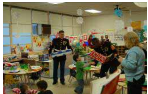
For the children