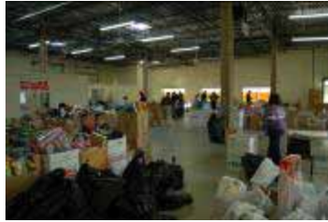
warehouse on 12/19