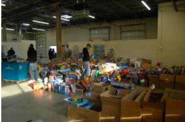
Marines from Ft. Meade helping to sort toys