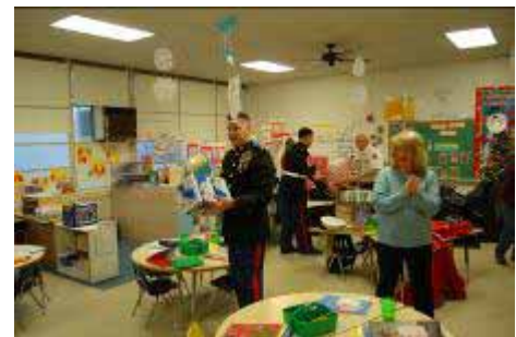
The 2 nd job of Marines, Santa's Helpers