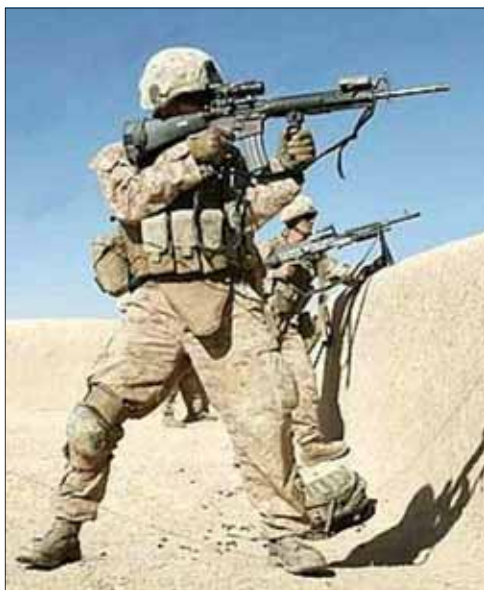
Marines firing on Taliban fighters in Afghanistan last month.

They fought America's foes house by house in Hue in 1968 and in Fallujah in 2004.