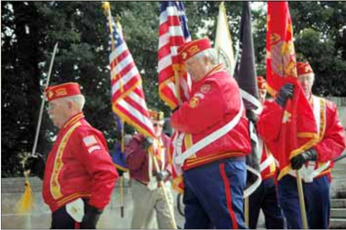
Detachment 1049 Color Guard participating in Pearl Harbor Day observance at the Naval Academy overlook.