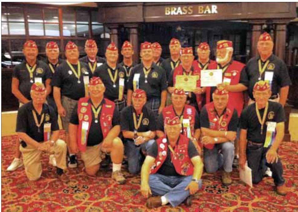
Members of the Maryland Pack of the Military Order of Devil Dogs at the Marine Corps League's 2010 National Convention in Greensboro, NC.

The Marine Corps League's National Convention and the Military Order of Devil Dogs' Supreme Growl took place in Greensboro, NC during the week of 8 through 14 August 2010. The Department of Maryland was well represented as was Anne Arundel County Detachment 1049.