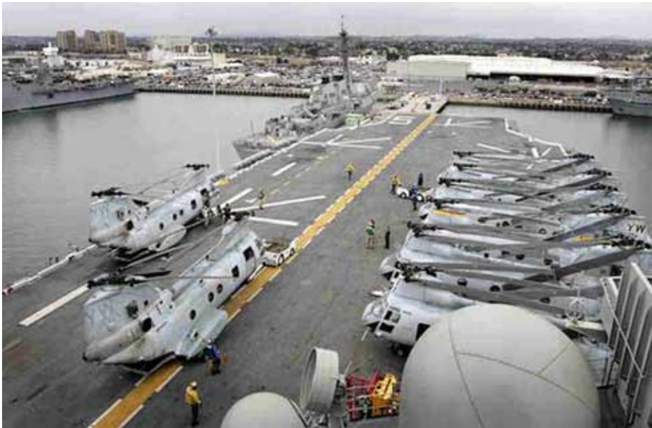
Helicopters from Miramar based squadron HMM-165 are parked on the deck of the USS Peleliu at Naval Base San Diego.

NOTE – The following is based upon an article by Gretel C. Kovach, Military Affairs writer for the San Diego Union-Tribune, which was originally posted on May 24, 2010.