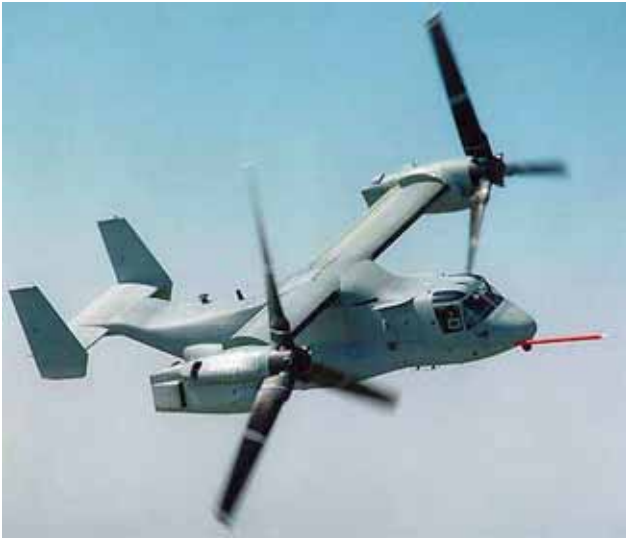
V-22 Osprey Medium-Lift, Multimission, Tilt-Rotor Aircraft

When the Peleliu’s deployment ends, some of its Sea Knights will fly directly to the bone-yard. The remainder will spend a few twilight years with other squadrons until the Marine Corps completes its transition to the long-awaited and controversial V-22 Osprey , a tilt-rotor aircraft that takes off like a helicopter but flies like a plane.