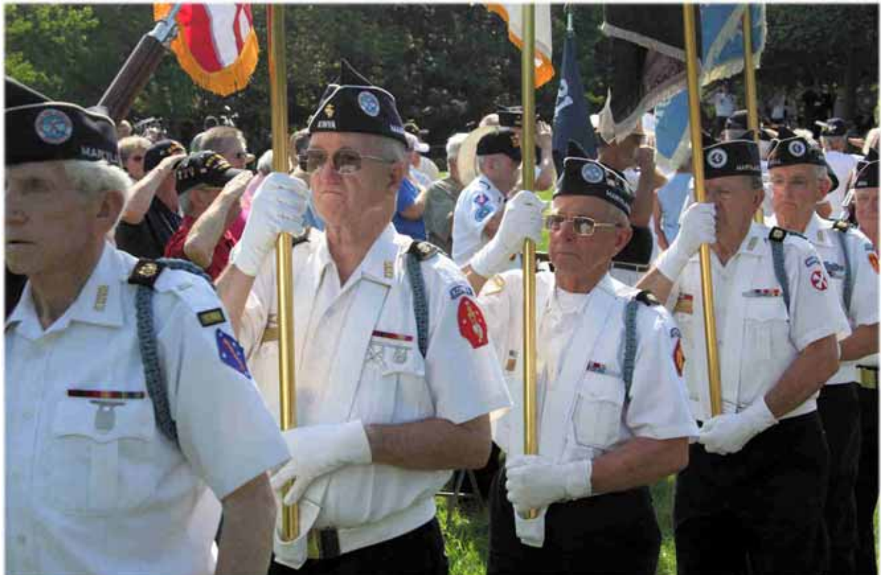
The Baltimore Korean War Veterans Honor Guard posts the colors during the Korean War Veterans Armistice Day Ceremony at the Korean War Veterans Memorial in Washington on July 27th. The ceremony marked the 57th anniversary of the cease fire agreement between the United Nations forces, North Korea and China, effectively ending the Korean War.