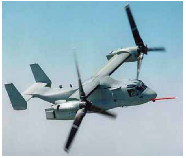
V-22 Osprey Medium-Lift, Multimission, Tilt-Rotor Aircraft

When the Pelelieu's deployment ends, some of its Sea Knights will fly directly to the bone-yard. The remainder will spend a few twilight years with other squadrons until the Marine Corps completes its transition to the long-awaited and controversial V-22 Osprey , a tilt-rotor aircraft that takes off like a helicopter but flies like a plane.