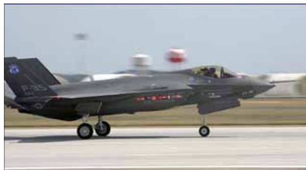
The Marine Corps is counting on the F-35B to replace its EA-6B Prowlers, AV-8B Harriers and F/A-18 Hornets.

Amid community concerns over the future location of F-35B Joint Strike Fighter squadrons, the Marine Corps is pushing forward with its basing plans. In May and June the Marine Corps released two environmental studies and continues to hold public meetings to address concerns.