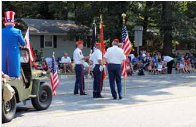
Uncle Sam & the Detachment Color Guard waiting for the parade to begin.