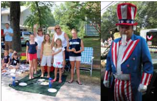
Severna Park families greeting parade participants.