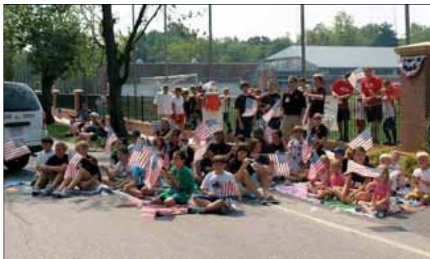
Severna Park youth displaying their patriotic spirit for all to see.