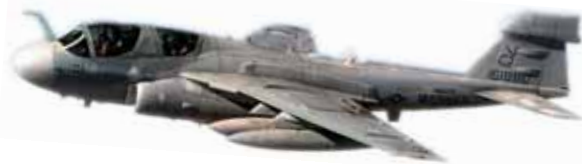
EA-6B Prowler of VMAQ-2, which has the role of defeating complex integrated air defense systems through the use of powerful pods (slung under each wing); thereby allowing attack jets and fighters to hit their targets.

When the five-hour firefight was over, at least nine U.S. service members, including two Marines from the EA-6B Prowler squadron, were wounded. One U.S. contractor and more than a dozen insurgents were killed in what is among the most intense ground fights involving a Marine Corps aviation squadron.