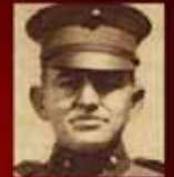
A Tribute to Lt. General John A. Lejeune

KOURY CONVENTION CENTER Greensboro North Carolina