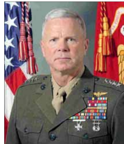
Gen. James Amos has been Assistant Commandant of the Marine Corps since July 2008.

The choice of Marine Corps commandant is the first service chief pick made by Mabus, who reportedly talked to every three- and four-star general in the Corps about the leadership choices. Mabus, should he remain in office, could also have the chance next year to name the next chief of naval operations, as current CNO Adm. Gary Roughead's term expires in September 2011.