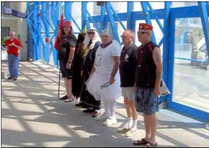
Pups hoping that they survive the arduous initiation ceremony that will elevate them to the status of Devil Dog.