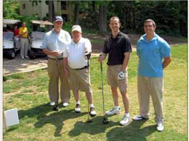
The Brady foursome consisting of our past Senior Vice Commandant and three deaf companions.