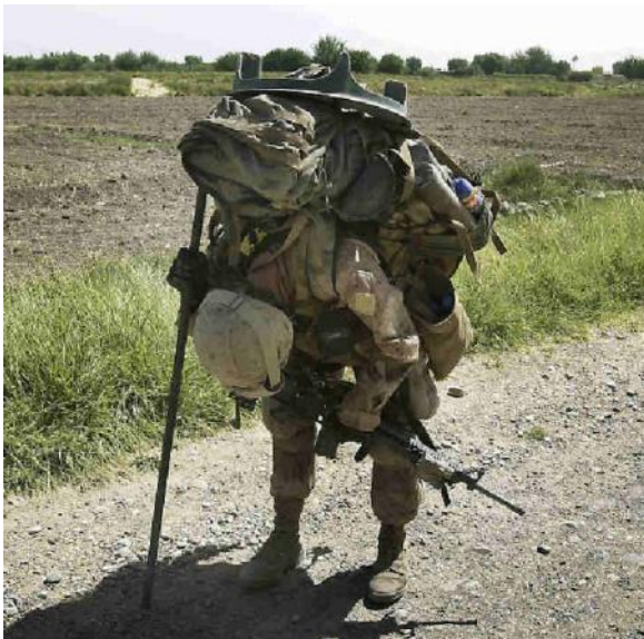
U.S. Marine – loaded with his heavy pack, mortar equipment, ammo, food, and water – pauses in the heat, to rest in the Nawa district of Afghanistan's Helmand Province on July 4, 2009.

NOTE: I received this photo in an email – Source of the information and the identity of the photographer are unknown.