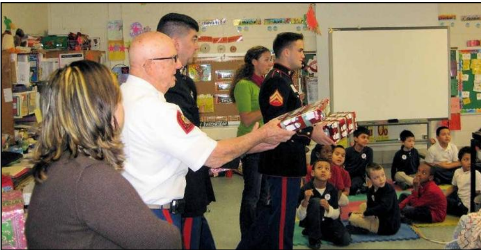
Marines from Fort Meade and members of Anne Arundel County Detachment 1049 distribute toys to needy children at the Maryland City Elementary School.

Hopes for the 2009 Christmas season were tempered with the impact of a depressed national economy, diminished disposable income at the family level, and an uncertain future for most American citizens. One of the few things that did not change was the fact that many children would probably not experience the joy of the holiday season simply because their families could not afford to buy them toys.