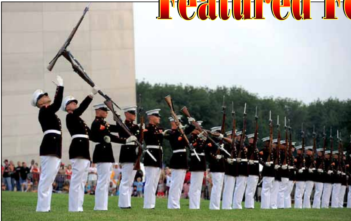
The Marine Corps Silent Drill Platoon performs for thousands of spectators at the Gateway Arch during Marine Week 2011 in St. Louis on June 25, 2201. The platoon traveled to St. Louis to perform two shows, one under the Gateway Arch and another during the closing ceremonies for Marine Week.