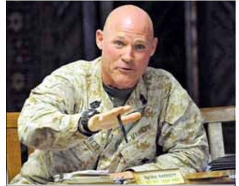
Sgt. Maj. Micheal Barrett is expected to take up new post in June.

Barrett also has a wide range of experience outside the combat zone. Notably, he served as the Company Gunnery Sergeant and Marine liaison to the U.S. Secret Service at the presidential retreat at Camp David, MD, from September 1996 to August 1998. He also has served as a drill instructor at Marine Corps Recruit Depot San Diego, a chief instructor at the Scout Sniper Instructor School at Marine Corps Base Quantico, VA, and as the top enlisted Marine at Recruiting Station Cleveland.