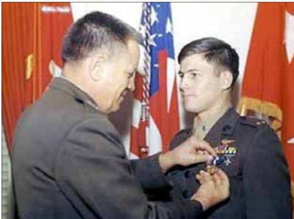
1st Lieutenant Marlantes receiving the Navy Cross for extraordinary heroism while serving as Executive Officer of C Company, 1st Battalion, 4th Marines, 3rd Marine Division (Reinf.) in connection with operations against the enemy in the Republic of Vietnam.

A graduate of Yale University and a Rhodes Scholar at Oxford University, Karl Marlantes served as a Marine in Vietnam, where he was awarded the Navy Cross , the Bronze Star , two Navy Commendation Medals for valor, two Purple Hearts , and ten Air Medals .