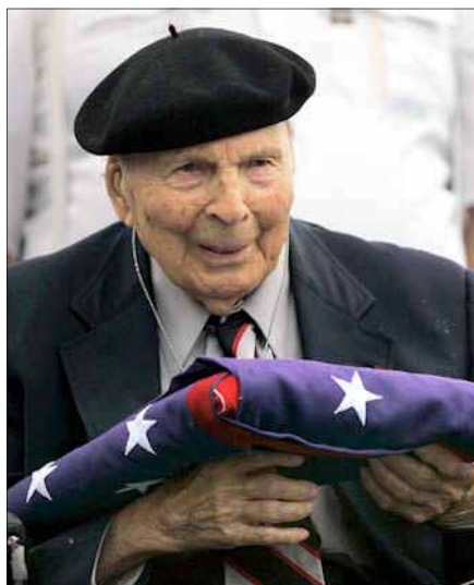
Frank Buckles receives an American flag during Memorial Day activities at the National World War I Museum in Kansas City, Missouri in May 2008.

He was back in Washington a year later to endorse a proposal to rededicate the existing World War I memorial on the National Mall as the official National World War I Memorial. He told a Senate panel it was “an excellent idea.” The memorial was originally built to honor the District of Columbia’s war dead.