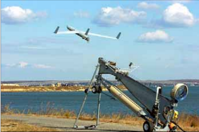
A ScanEagle unmanned aircraft is launched from a test range in Dahlgren, Va. The 13th MEU commander has high hopes for the system during its deployment to the western Pacific and Persian Gulf.

SAN DIEGO – The 13th Marine Expeditionary Unit deployed in late February with the ScanEagle unmanned aircraft, marking the first time any MEU has taken the combat-proven drone out to sea for an operational assignment, officials said.