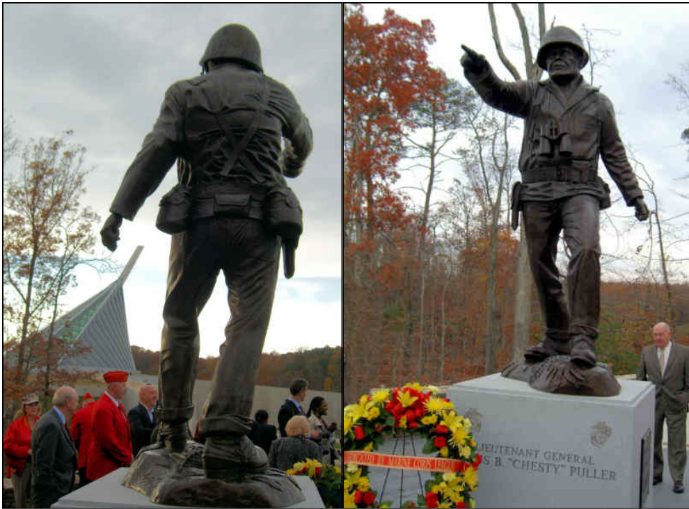
Marines of many generations, accompanied by members of their families, gathered at the National Museum of the Marine Corps on the afternoon of November 12, 2012 to be part of the statue dedication honoring legendary Marine Lieutenant General Lewis B. 'Chesty' Puller.

A diverse collection of Marines – officers, enlisted, young, old, active duty, retired and those who served a single tour – recently gathered at the National Museum of the Marine Corps in Triangle, VA. Among them, office penguins, mud-Marines (grunts), air-wingers, etc. – some who experienced combat in WWII, Korea, Vietnam, Desert Storm/Shield, Iraq, and/or Afghanistan. Amongst the remaining spectators were those Marines who were prepared to fight though they were never called, family members, members of the Young Marines, civilian and military dignitaries, as well as the President's Own – The Marine Corps Band .