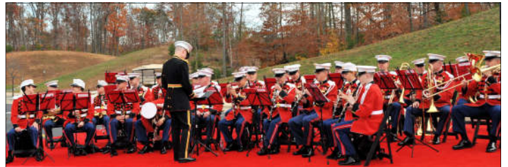
The Marine Corps Band – 'The President's Own'