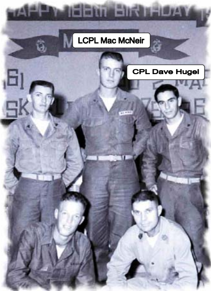
Five Baltimore Marines – 188th Birthday Ball (1963) at Danang, Republic of Vietnam