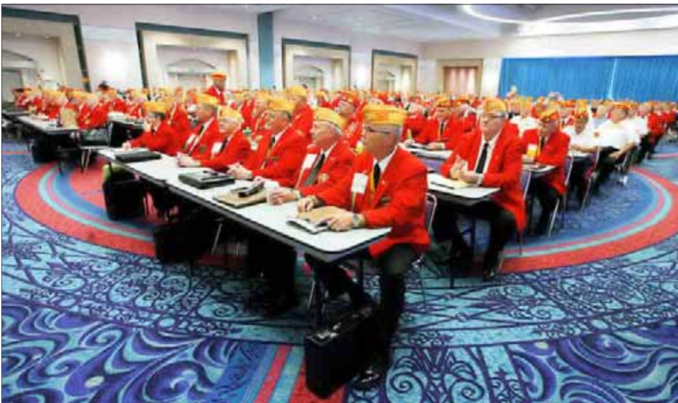
Members of the Marine Corps League attending one of the many business sessions conducted during the 2012 national convention, which was held recently in Mobile, Alabama.