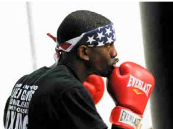
Marine Sgt. Jamel Herring works out at the Olympic Training Center in Colorado Springs, CO.

Sergeant Jamel Herring almost gave up boxing. He joined the Marine Corps right out of high school in 2003, hoping to go to war. He got his wish.