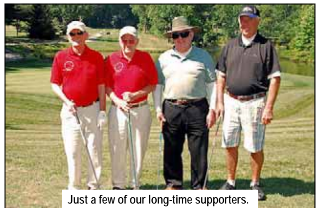
Just a few of our long-time supporters.