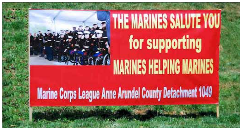
With regard to the 7th Annual Marines Helping Marines Tournament...the sign that said it all!

The 7th annual edition of the Marines Helping Marines Tournament was another in an ongoing string of successful tournaments, which have been hosted by the Anne Arundel County Detachment of the Marine Corps League . Although most participants would focus on the events that took place at the Bay Hills Golf Club in Arnold, Maryland on May 18th, the success of this year's fund-raiser also requires a look back at the many preliminary efforts that took place months earlier.