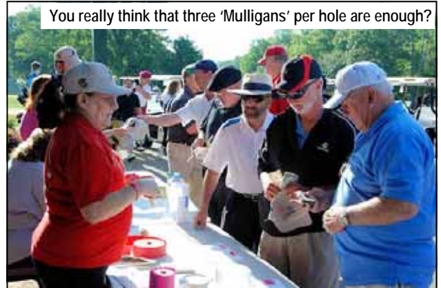
You really think that three 'Mulligans' per hole are enough?