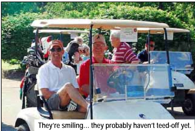
They're smiling... they probably haven't teed-off yet.