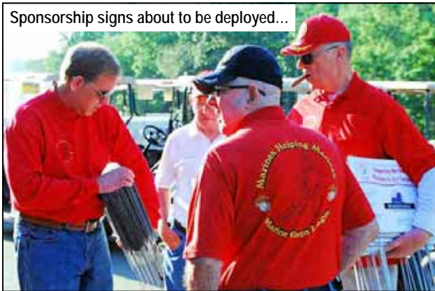
Sponsorship signs about to be deployed...