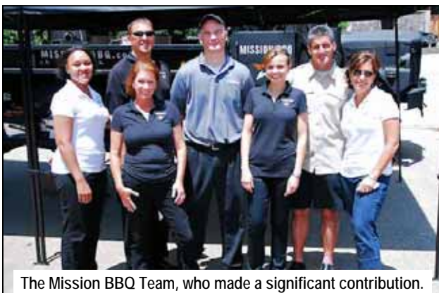
The Mission BBQ Team, who made a significant contribution.