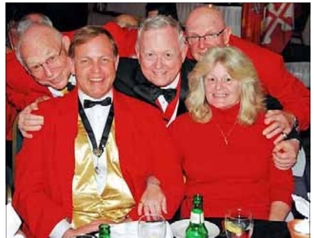
What do you mean "Who are they?" I thought they were friends of yours!