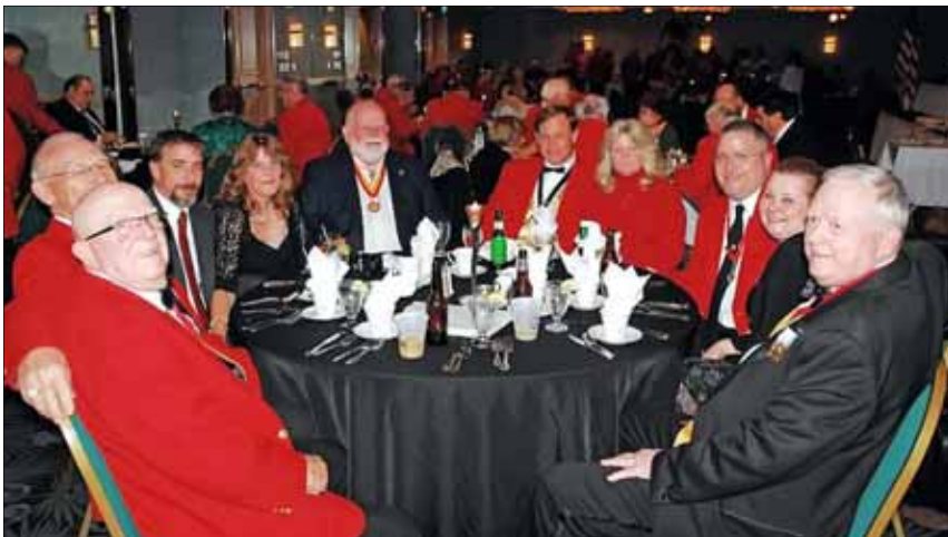
You mean you're serious? You really want to sit with us?