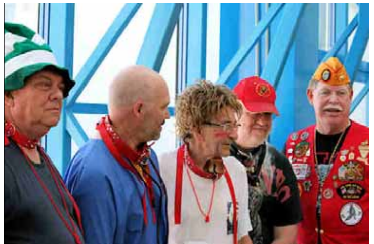
The Chief Devil Dog informs our new Devil Dogs and a Pup of the importance of attending Growls. Guess which one of them missed the Pack Growl, which took place little more than an hour later.