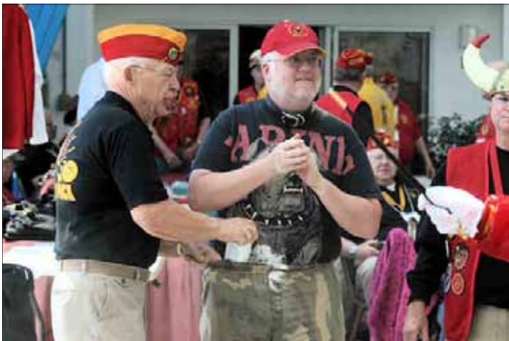
Maybe... if I continue to ignore him... he'll take his hands out of my shorts and go away.