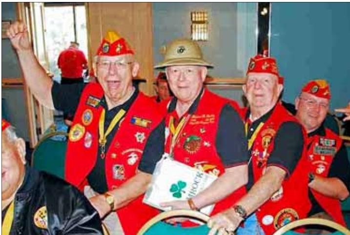
A case of musical chairs run amok?