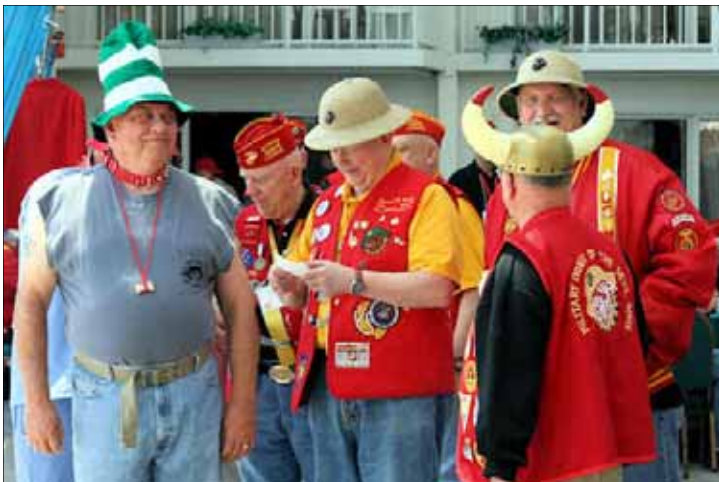
I think this is truly a first! Have we ever have a Pup bring us a note from his mother before?