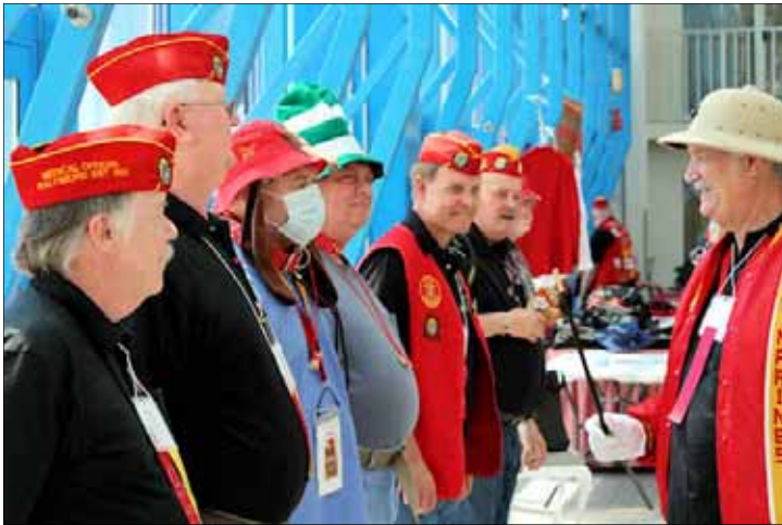
Obviously, some of us didn't get the word about the appropriate uniform.