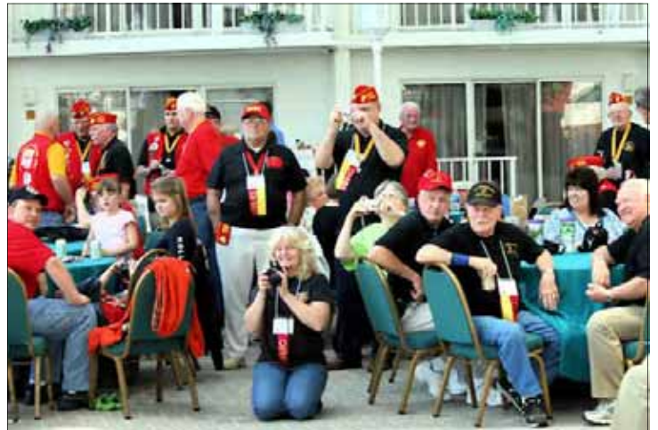
Spectators wondering why Pete's hands are in the shorts of another dog.