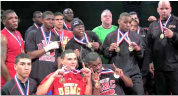
The All-Marine Boxing Team won gold during the 2012 United States Armed Forces Boxing Tournament at Marine Corps Base Camp Pendleton, CA on February 3rd. Members of the team are slated to compete for places on the 2012 USA Olympic Boxing Team.