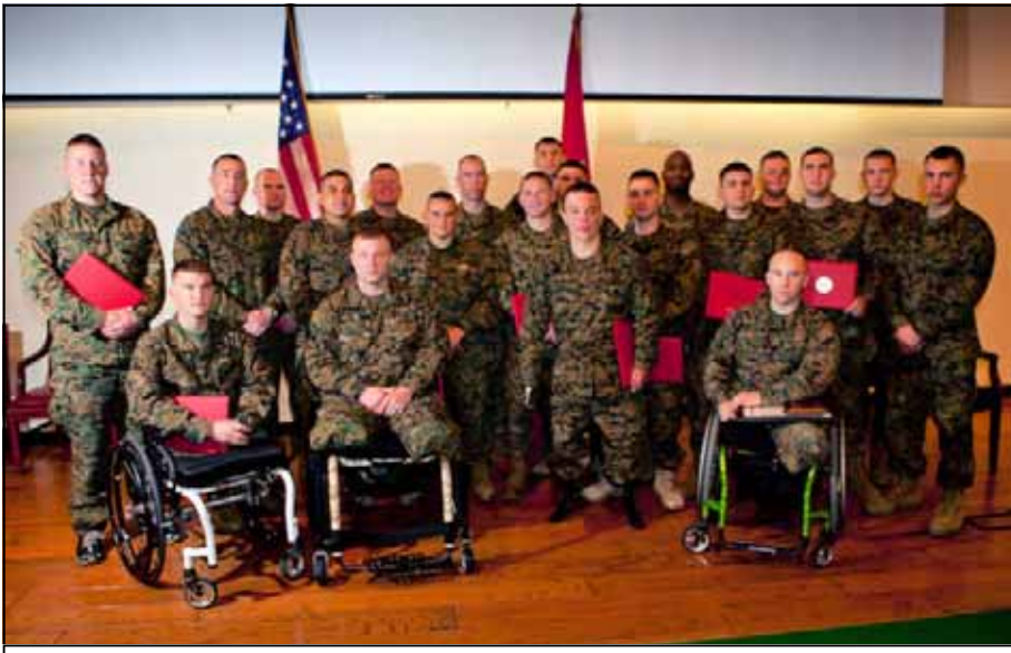
The graduating class of the first Wounded Warrior Detachment Corporal's Course at Walter Reed National Military Medical Center at Bethesda, MD, on January 16th. The detachment's goal is to continue professional development classes to wounded warriors throughout the Marine Corps.