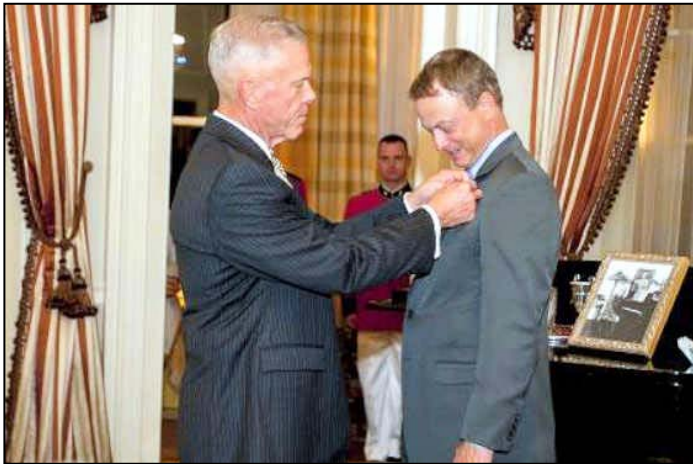
General James Amos, Commandant of the Marine Corps, pins an eagle, globe, and anchor lapel pin on actor and musician, Gary Sinise, after naming him an Honorary Marine at Marine Barracks Washington, DC, on August 29th.

The actor, Gary Sinise , known for his iconic portrayal of the sharp-tongued soldier Lieutenant Dan in the 1994 film and for his long run on the CBS series CSI New York , was recently made an honorary Marine in an intimate dinner ceremony at the home of Marine Corps Commandant General James Amos .