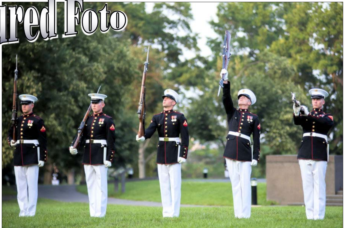
Marine Corps Silent Drill Platoon members perform during a Tuesday Sunset Parade at the Marine Corps War Memorial in Arlington, Virginia on July 9th.