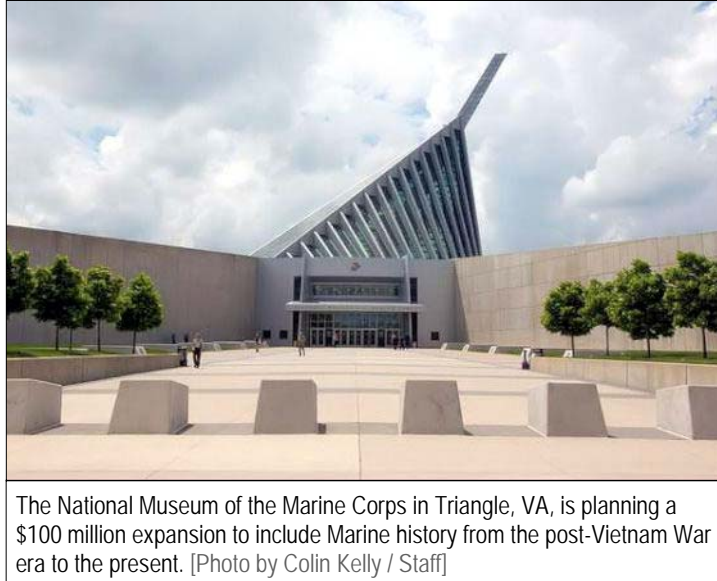
The National Museum of the Marine Corps in Triangle, VA, is planning a $100 million expansion to include Marine history from the post-Vietnam War era to the present.