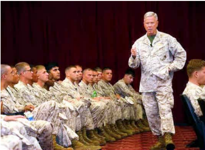
General James F. Amos, Commandant of the Marine Corps, addresses Marines at the base theater on July 15, 2013. Amos and Sergeant Major Micheal P. Barrett , Sergeant Major of the Marine Corps, visited Marine Corps Base Hawaii to discuss issues circulating within the Marine Corps.

General James Amos , Commandant of the Marine Corps, reassured Marines in Hawaii last week that he was committed to keeping the distinctive MARPAT camouflage pattern for Marines, even as lawmakers consider adopting a single camouflage pattern for all of the services.