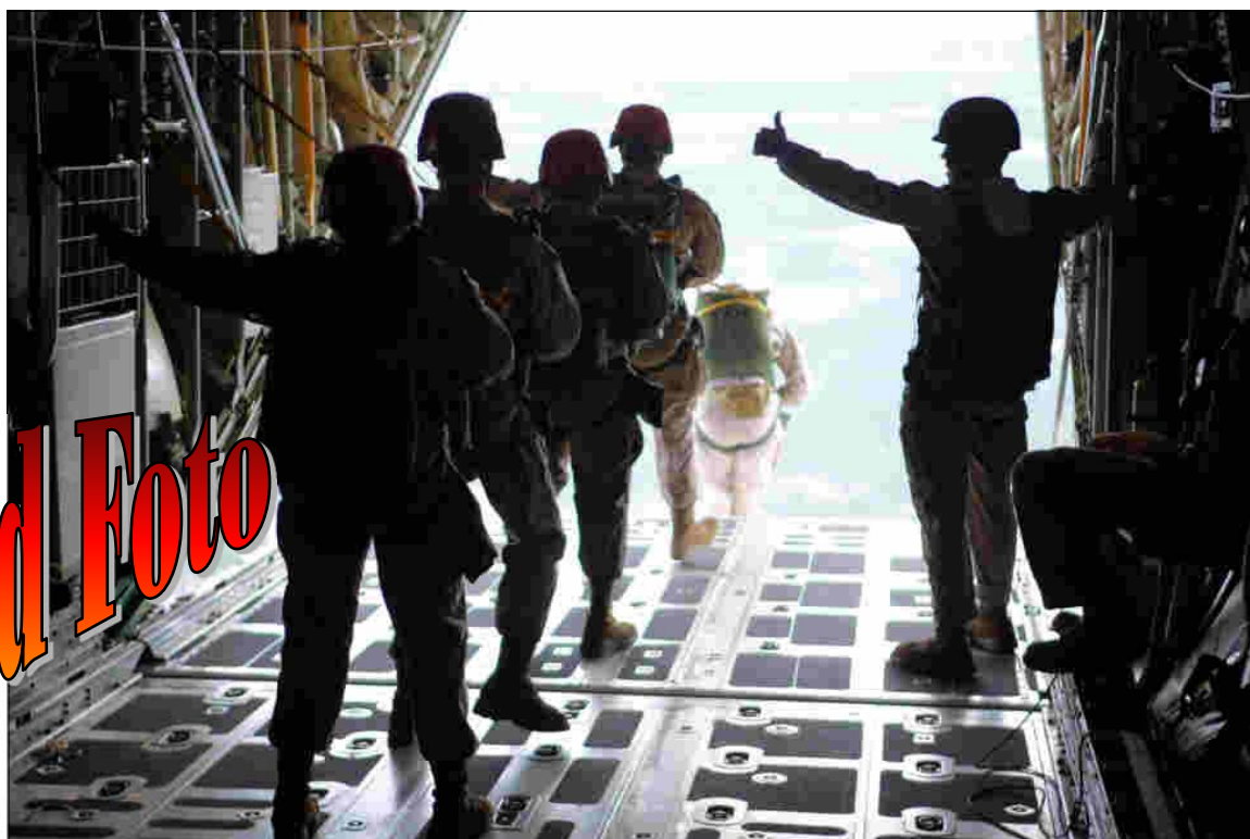
Camp Lejeune, North Carolina - An assistant jump master gives Marines from Landing Support Company, Combat Logistics Regiment 27, 2nd Marine Logistics Group the 'OK' to jump during an airborne exercise near Camp Lejeune, NC, on March 20, 2013. Marines jumped from a height of 1200 feet to meet their quarterly requirement.