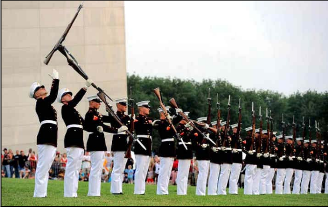
Future performances of the Corps' ceremonial units were canceled due to budget cuts. Pictured is the Marine Corps Silent Drill Platoon performing at the Gateway Arch in St. Louis in 2011.

The Marine Corps' premier ceremonial unit is the latest target of federal budget cuts.