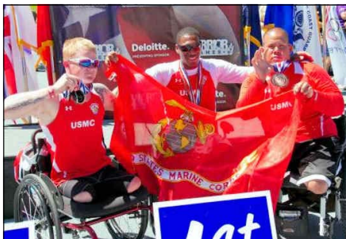
Members of the Marine Corps Track and Field team display medals earned at the 2012 Warrior Games.

The 48 athletes include 21 active-duty Marines from Wounded Warrior Battalion West , 21 USMC veterans, and six Marines from Wounded Warrior Battalion East . They competed for spots on the Corps roster for the week-long Marine Corps trials aboard Camp Pendleton scheduled for the beginning of March. It would seem that home field advantage worked out well for the West Coast Marines, but they will all play on the same team moving forward.