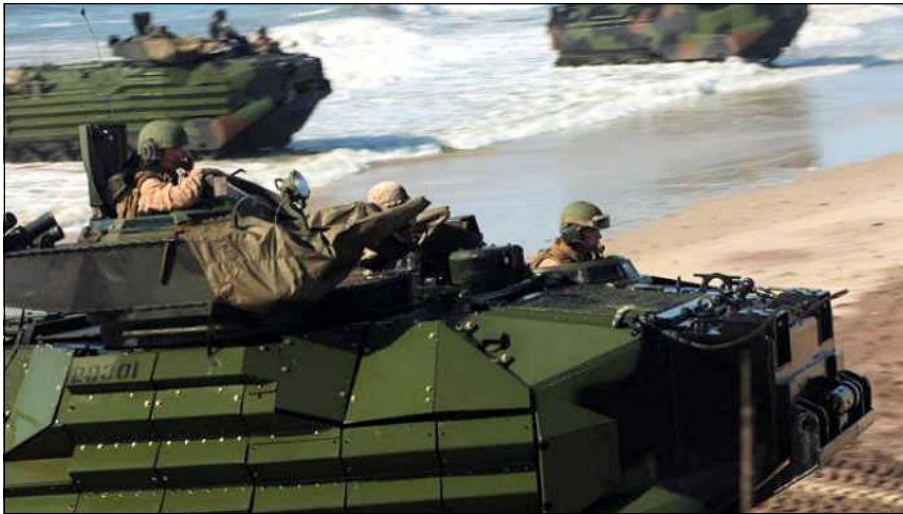
U.S. Marines taking part in a training exercise at Onslow Beach, Camp Lejeune, North Carolina.