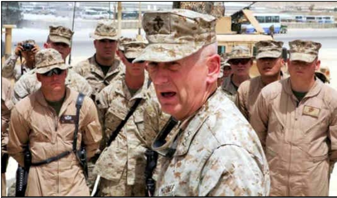
AL ASAD, Iraq – Marine Lieutenant General James Mattis, Commander of the U.S. Central Command, speaks to Marines with Marine Wing Support Group 27.

Mattis was replaced as the head of CENTCOM, out of Tampa, FL., by Army General Lloyd Austin . It's expected he'll retire following a short period of transition behind the scenes.