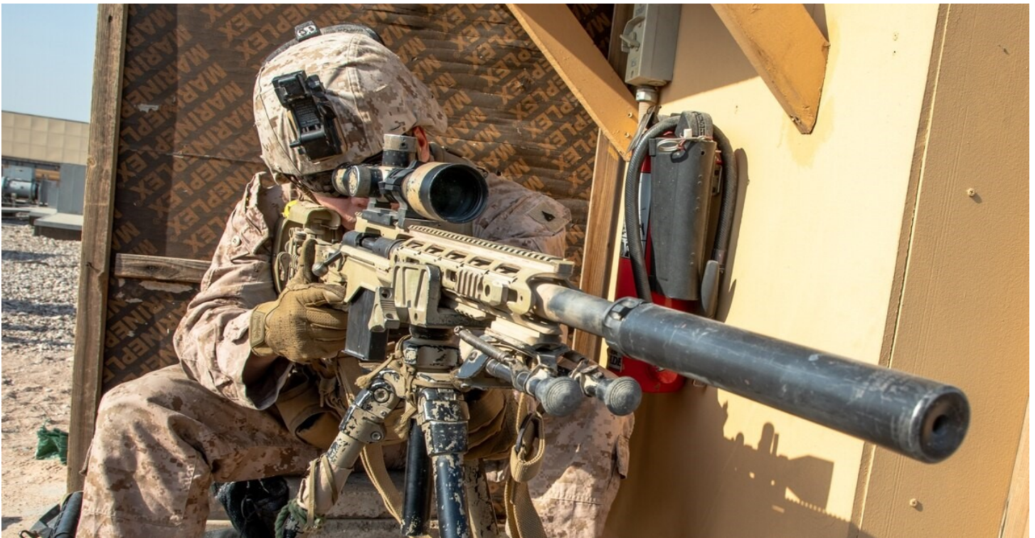
A U.S. Marine with 2nd Battalion, 7th Marines, assigned to the Special Purpose Marine Air-Ground Task Force-Crisis Response-Central Command (SPMAGTF-CR-CC) 19.2, provides long-range over watch security with an M40A6 sniper rifle at the Baghdad Embassy Compound in Iraq, Jan. 3, 2020.