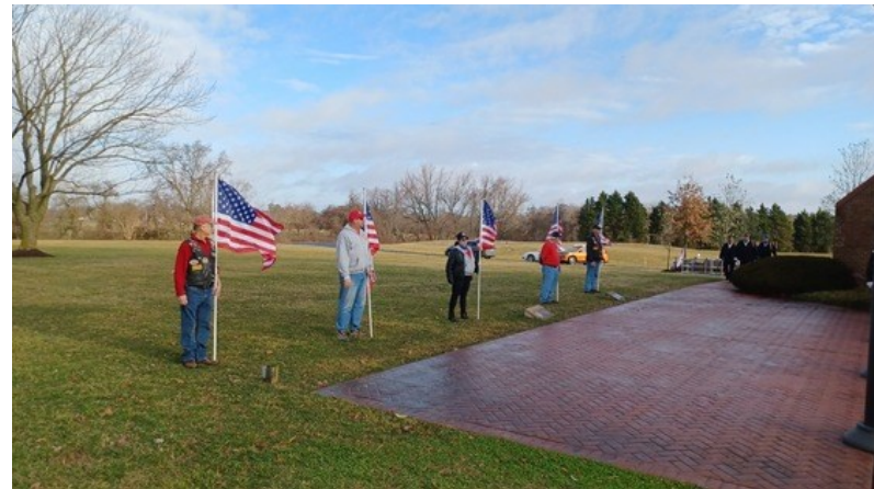
Maryland Patriot Guard at the Unaccompanied Veterans Ceremony at the MDVA Eastern Shore cemetery.