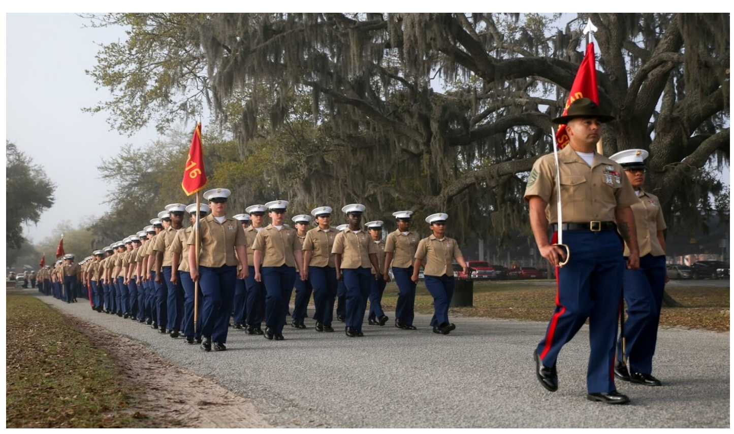
Marines with the 3rd Recruit Training Battalion's India Company — the first combined company of male and female recruits — march ahead of graduation ceremonies on March 29, 2019.