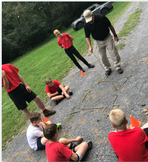
Sand table on fort designs