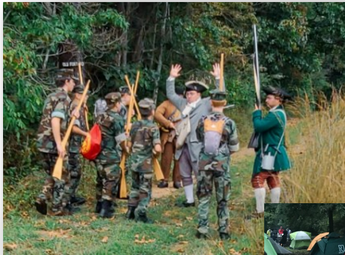
Capturing a French spy