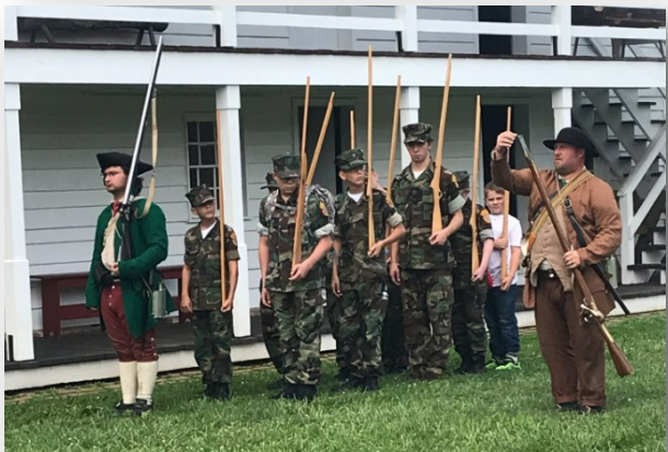
More drill.. Colonial style